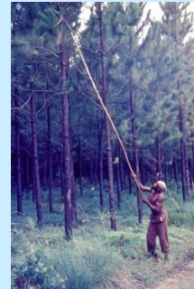
Fig. 2: Manual Pruning of Pine (South Africa)

Nearly 60 million hectares of plantation forests (Fig. 2) have been established in the tropics (FAO, 2016).