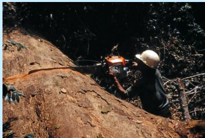
Fig. 1: Cross-cutting Felled Tree (Indonesia)