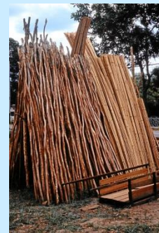
Fig. 4: Construction Wood for Small Scale Use (Indonesia)